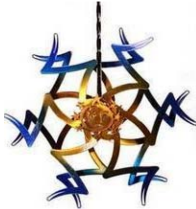
Celestial Blue/Copper 92ETMCELEBC