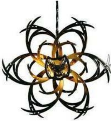
Buck Black/Copper 92ETMDEERRC

EyTwisters™ are made from durable powder coated laser cut steel using the same quality control as our famous WindSpinners. Proudly made in the U.S.A.