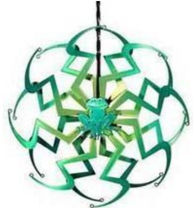
Frog Yellow/Green 92ETMFROGYG