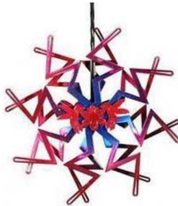
Hummingbird Blue/Red ETMHUMMI BR