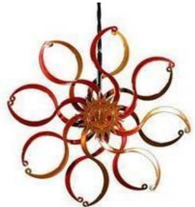
Sun Red/Copper ETMSUMRC