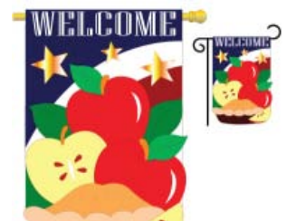
American Pie NEW

11049 (03-01000) 28"x44" 61049 (03-0500) 13.5"x18" Metallic Stitching Letters are Appliqued on both sides