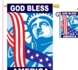
God Bless America

11046 (03-0950) 28"x44" 61046 (03-0475) 13.5"x18" Metallic Stitching Letters are Appliqued on both sides