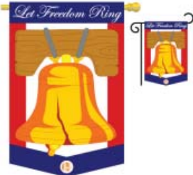
Let Freedom Ring

11048 (03-01050) 28"x44" 61048 (03-0525) 13.5"x18" Metallic Stitching Letters are Appliqued on both sides