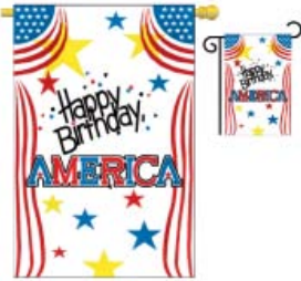
Happy Birthday USA

11027 (03-0900) 28"x44" 61027 (03-0425) 13.5"x18"