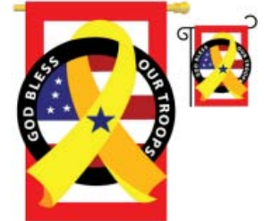
God Bless Our Troops

11047 (03-01050) 28"x44" 61047 (03-0525) 13.5"x18" Metallic Stitching Letters are Appliqued on both sides Sewn on Transparent Fabric