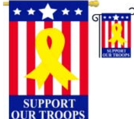
Support Our Troops

11043 (03-0950) 28"x44" 61043 (03-0475) 13.5"x18" Metallic Stitching Letters are Appliqued on both sides