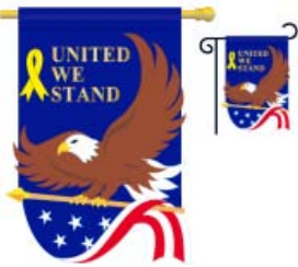
United We Stand

11041 (03-0950) 28"x44" 61041 (03-0475) 13.5"x18" Metallic Stitching Letters are Appliqued on both sides