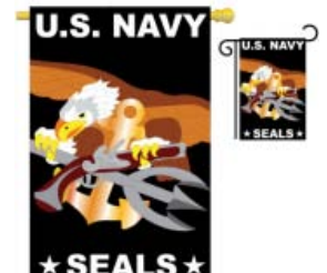
US Navy Seals

08051 (03-01050) 28"x44" 58051 (03-0525) 13.5"x18" Metallic Stitching