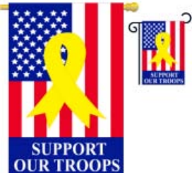
Support Our Troops

11042 (03-01000) 28"x44" 61042 (03-0500) 13.5"x18" Metallic Stitching Letters are Appliqued on both sides