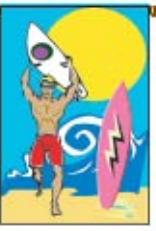
[ 7.50 Now 4.00