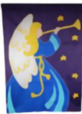
[ 7.00 Now 4.00