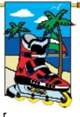
[ 7.50 Now 4.00