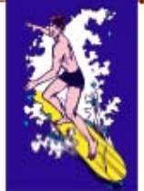
[ 7.50 Now 4.00