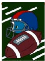
09005 [ 7.50 Now 4.00