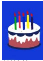
15002 28" 8.00 Now 4.00