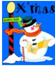
14040 28"x40" 8.00 Now 4.00