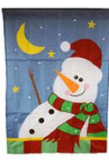
F0808 Nylon 7.00 Now 4.00