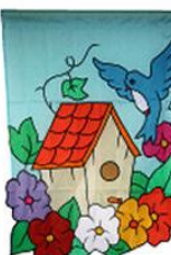
F02654 Nylon 7.00 Now 4.00