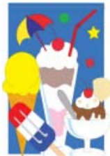
[ 9.00 Now 4.00