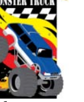
[ 9.00 Now 4.00