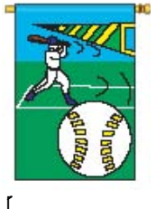
[ 7.50 Now 4.00