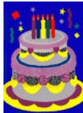
15001 28" 8.00 Now 4.00