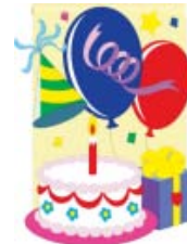
[ 9.00 Now 4.00