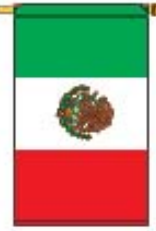
[ 7.00 Now 4.00