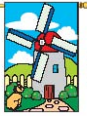
[ 6.50 Now 4.00