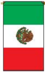
[ 8.00 Now 4.00