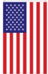
Screen Print Dark Red Color 4.00 Now 2.00