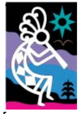
[ 8.50 Now 4.00