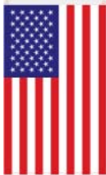
Deluxe Embroidered Nylon 9.00 Now 4.00