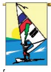
[ 7.50 Now 4.00