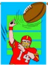
09006 [ 7.50 Now 4.00