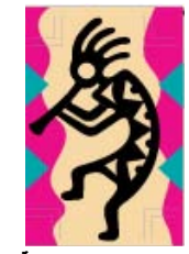
[ 8.50 Now 4.00