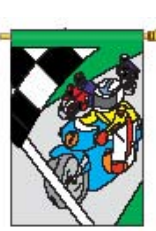
[ 7.50 Now 4.00