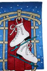
F0827 Nylon 7.00 Now 4.00