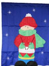
F0802 Nylon 7.00 Now 4.00