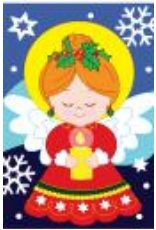
14066 [ 7.00 Now 4.00