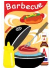
[ 9.00 Now 4.00