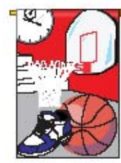
[ 8.50 Now 4.00