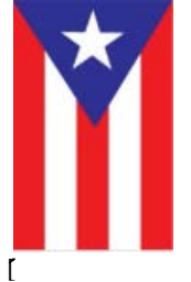
[ 9.50 Now 4.00